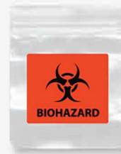
Plastic bag with biohazard label