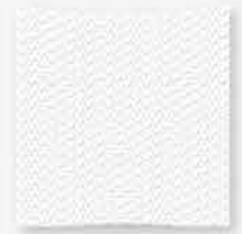
Padding for shipping